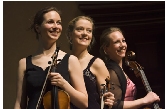
The Lendvai String Trio